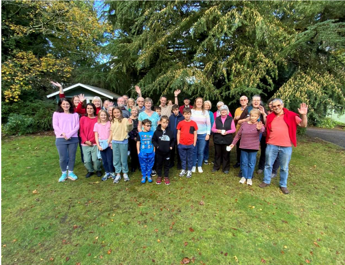
Hebron Church Weekend Away, October 2023