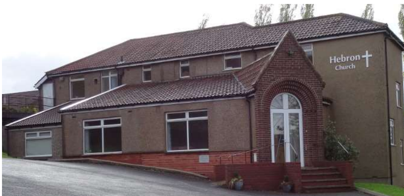
Hebron Church Building

The church building is situated on Providence Lane, overlooking the village. Built as both a church and a home for the first pastor, Ernest Dyer, it has been updated and extended over the years, with significant investment recently in replacing the roof, fire escape and electrical re-wire. The main meeting space accommodates up to 80 people and