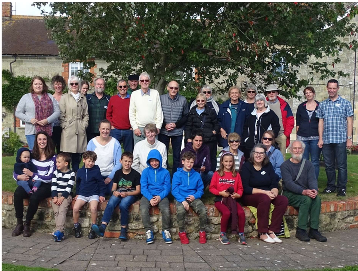
Our church weekend away in 2021