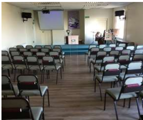
Main meeting space

has a baptistry. An adjacent hall provides further informal meeting space and access to a recently refitted kitchen, allowing us to cater for church lunches and other events. Upstairs space comprises of three meeting rooms used by our children's and youth groups, storage and a small office.